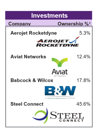
<sup>1</sup>Ownership % as of 12/31/2018