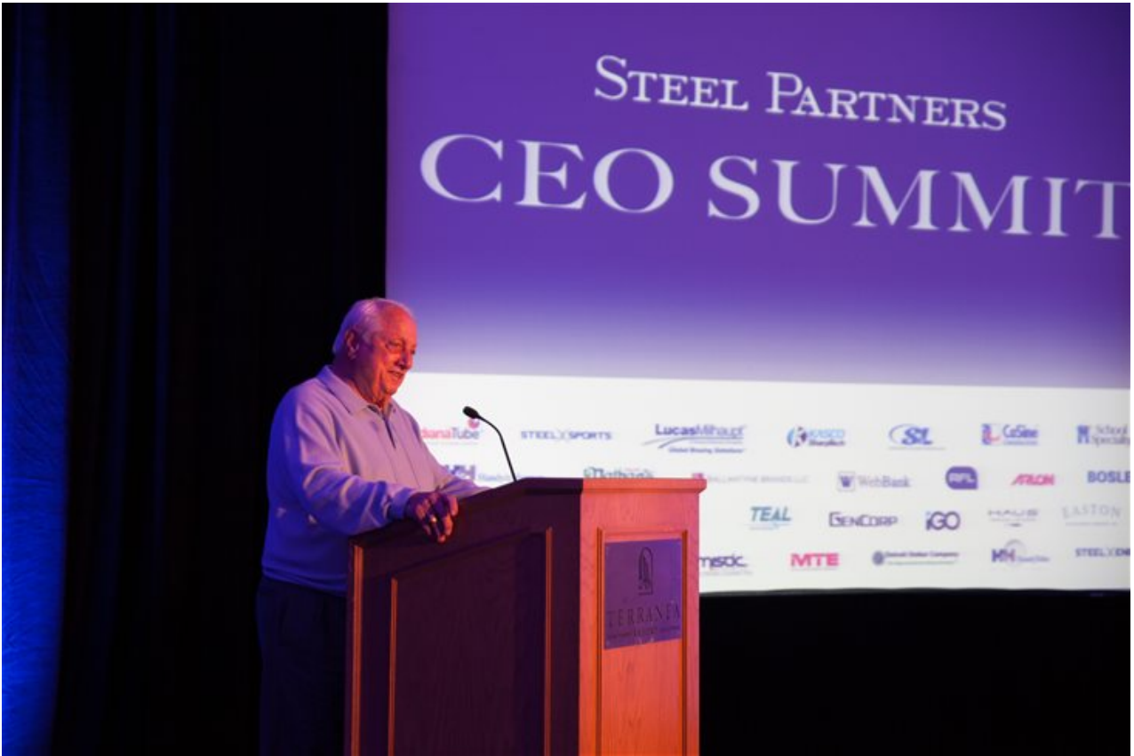
The legendary Ambassador to baseball, Tommy Lasorda, shared some of his experiences and wisdom at the 2014 Steel Partners CEO Summit.